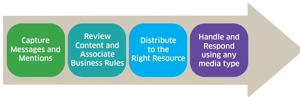
Figure 1: Genesys Social Engagement enables management of social media communication for one conversation with the customer

You can think of your social media strategy as four general steps, progressing from passive listening to active customer engagement and integration.