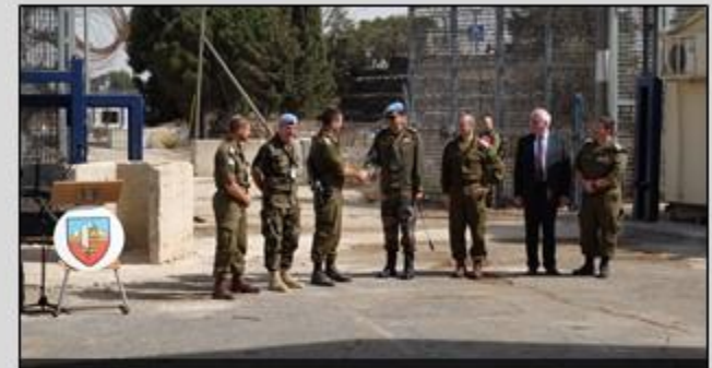
Reopening of the Quneitra Crossing

The IDF is to remain west of the Alpha Line.