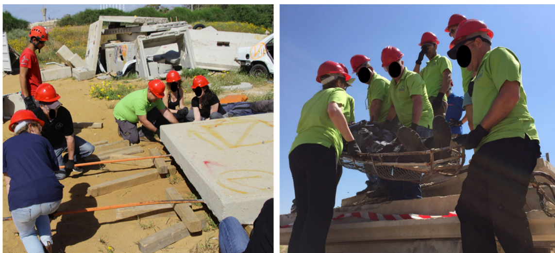
Fig. 1. Examples of Light Search and Rescue (LSR) training in Israel.

and a construct of self-efficacy. Both constructs were assessed via a self-reporting questionnaire. Resilience was assessed with seven items presented on a 5-point Likert scale: (a) I think I know what to do in case of a major earthquake; (b) I think I will be capable of coping with the consequences of a major earthquake; (c) I think I know how to extract trapped people from underneath a building rubble; (d) I feel I have enough mental resilience to deal with the consequences of a major earthquake; (e) I feel I have enough physical resilience to deal with the consequences of a major earthquake; (f) I feel uncertain about anything relating to coping with major earthquakes. The Resilience construct was computed as the mean of all seven items following reversing the order of the responses of the last item. The reliability of the construct was assessed using Cronbach's alpha test for both pre-training and post-training datasets, resulting in values of 0.762 and 0.758, respectively.