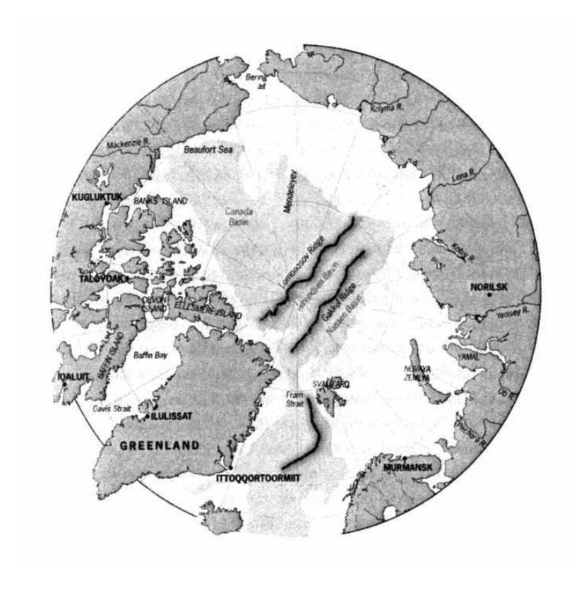
Figure 1 – A different perspective of the globe

The second characteristic visible from this view of the Arctic, is represented by the extended continental shelves, which cover almost half of the Arctic Ocean's depths. As they used to be a simple geographical fact, the extended continental shelves are now in the middle of the international politics and diplomatic arenas. The most important, the Lomosonov Ridge, is connecting Russia to Canada. These two countries are as such busy using diplomatic and scientific means to demonstrate that this ridge is a natural extension of their respective continental shelves. The successful demonstration of this extension would allow them to claim exploitation rights to the resources found on the ridge (Christensen, 2005, p.30). The last geographic particularity to be covered by this paper, is without a doubt the Russian's domination of the