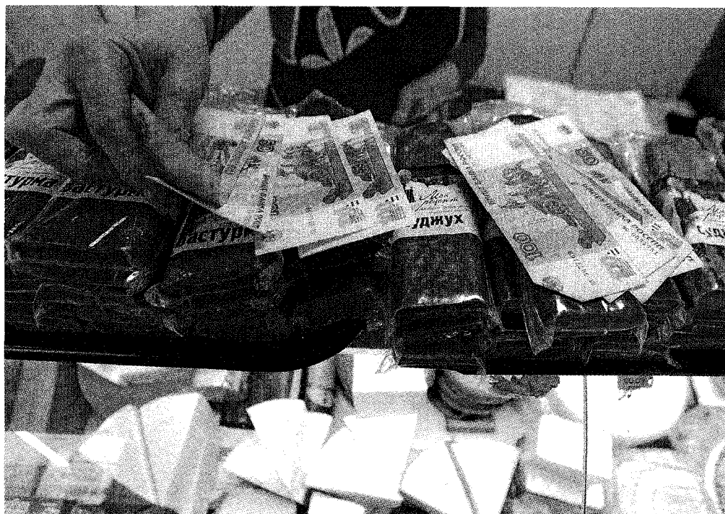
Money for nothing: at a market in Stavropol, southern Russia, January 2016

if Russia's rise in the ranking owed largely to a change in the index's methodology.