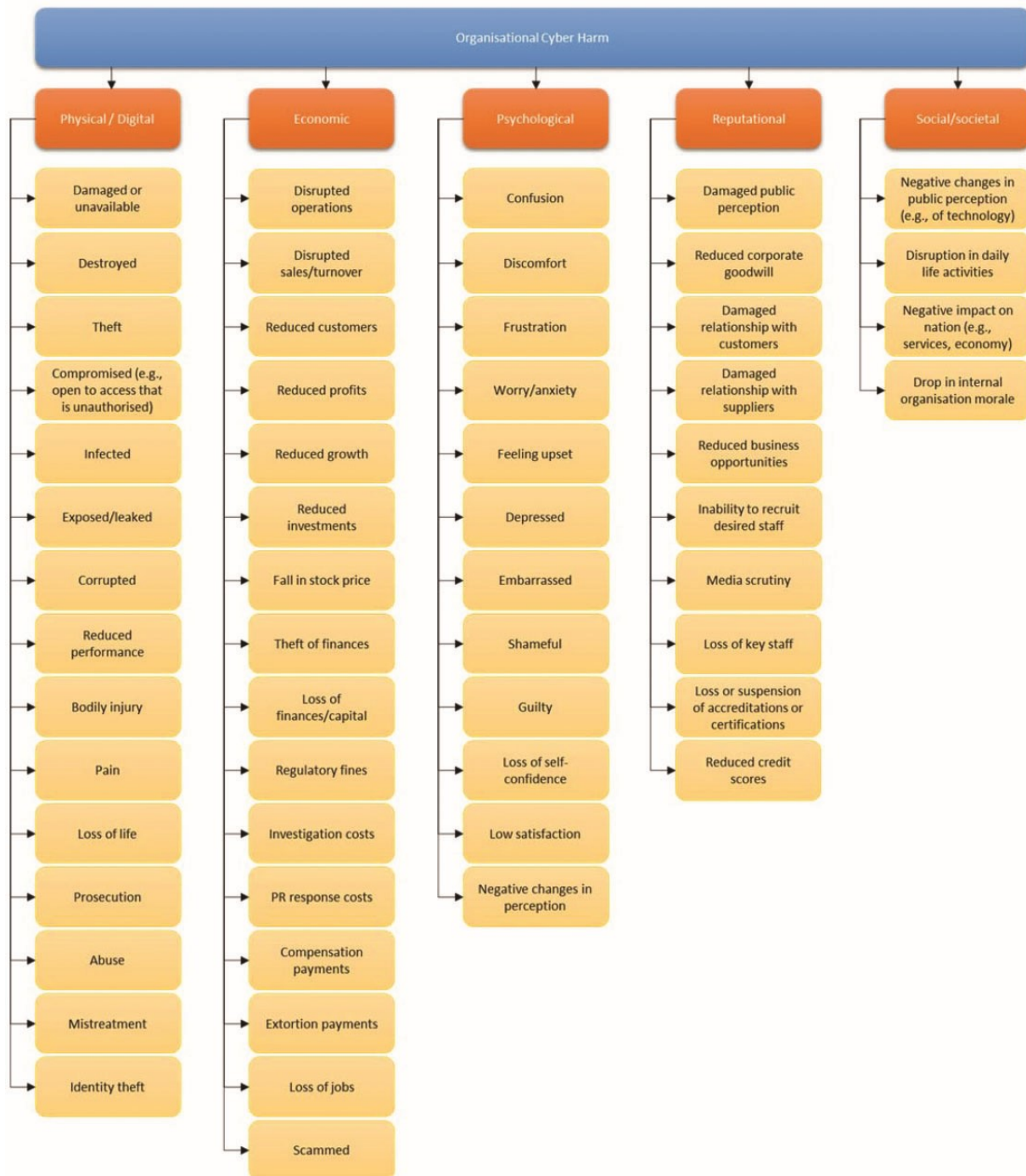
Figure 1. Taxonomy of organizational cyber-harms.

completely avoid the company. Social-media platforms such as Twitter can exacerbate this harm due to the great visibility they give to customers and the public [35]. This highlights a subset of the wide span of consequential harms, captured in the taxonomy, that result from cyber-incidents.