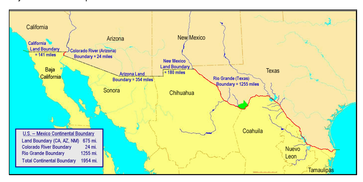
Figure 1. Picture of the US-Mexican Border (Commission)

of immigrant parents are less likely to have health insurance or regular access to health care versus children of nonimmigrant parents (Perreira and Ornelas, 2011). Since their access to medical care is forgone, medical attention is often received when an urgent condition has developed and emergency care is required (Perreira and Ornelas, 2011). The ramifications of these policies have criminalized many immigrants. The policies have claimed to target immigrants that have committed serious crimes, but many of the detained persons have committed petty infractions that would have been prosecuted much differently for many Americans. In North Carolina, of the 3,100 immigrants detained and placed in deportation proceedings, more than 1,200 of them were detained due to traffic violations, as illustrated in Figure 2 (Hagan, 2010). These events have caused immigrant populations to withdraw from society out of fear of deportation.