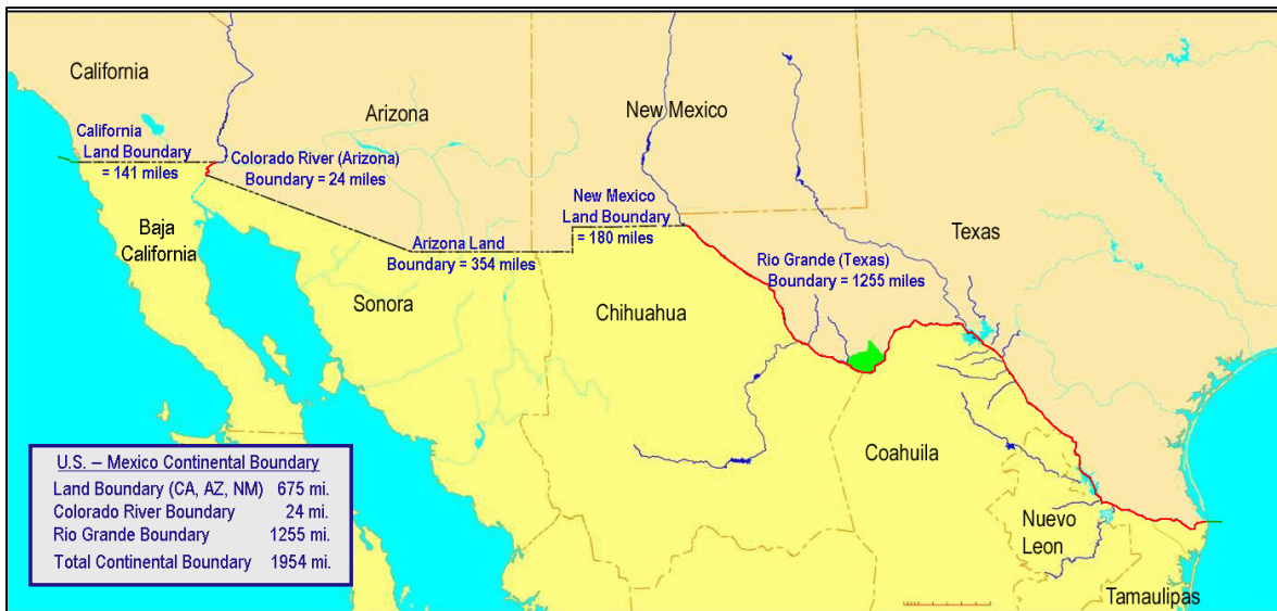
Figure 1. Picture of the US-Mexican Border (Commission)

of immigrant parents are less likely to have health insurance or regular access to health care versus children of nonimmigrant parents (Perreira and Ornelas, 2011). Since their access to medical care is forgone, medical attention is often received when an urgent condition has developed and emergency care is required (Perreira and Ornelas, 2011). The ramifications of these policies have criminalized many immigrants. The policies have claimed to target immigrants that have committed serious crimes, but many of the detained persons have committed petty infractions that would have been prosecuted much differently for many Americans. In North Carolina, of the 3,100 immigrants detained and placed in deportation proceedings, more than 1,200 of them were detained due to traffic violations, as illustrated in Figure 2 (Hagan, 2010). These events have caused immigrant populations to withdraw from society out of fear of deportation.