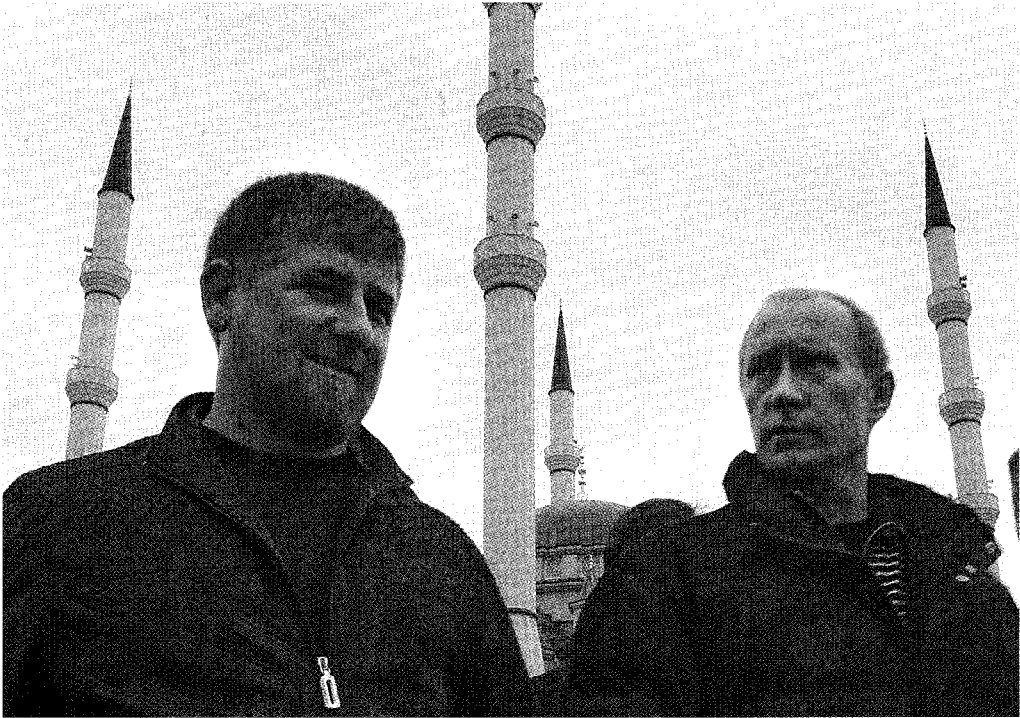
My buddy and me: Ramzan Kadyrov and Vladimir Putin in Grozny, October 2008

Kremlin as “curators,” semiofficial figures through whom state governance flows. A curator is a political bureaucrat, a project manager authorized by the Kremlin to operate through personal agents. The curator is not publicly responsible for his agents’ actions, and the agents follow his instructions only as long as they benefit from doing so. If a curator meets resistance, he is free to punish the recalcitrant party, either through bureaucratic means or by replacing him with another agent.