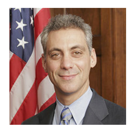
Rahm Emanuel Mayor of the City of Chicago

Rahm Emanuel was elected the 55th mayor of the City of Chicago on February 22nd, 2011 and was sworn in on May 16th, 2011. He was elected to a second term in 2015 and sworn in on May 18, 2015.